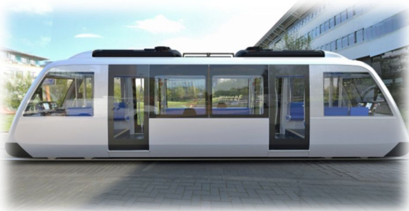
A Coventry VLR example.

Liverpool City Region Wirral, The North West showcase doorway