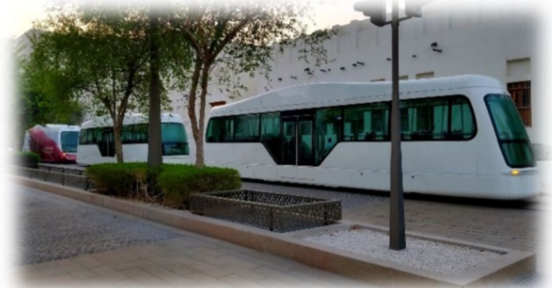
City Cars (3) autonomously coupled, 300 passengers