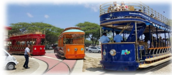
Self-powered new build tradition summer tram cars